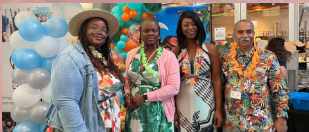
CFCE Adoption Unit

After a two-year hiatus necessitated by the COVID pandemic, families and child welfare professionals alike were excited to gather again to celebrate one of the most anticipated events of the year. As in years past, the Miami Children's Museum hosted Miami Dade County's 2022 National Adoption Day event. This year's theme was all about snowflakes because snowflakes are unique, just like each of our forever families! More than 30 adoptions were finalized at this year's National Adoption Day.