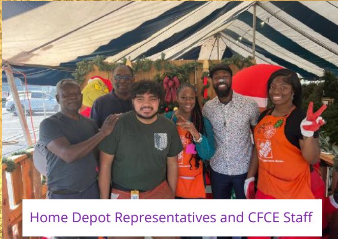
Home Depot Representatives and CFCE Staff